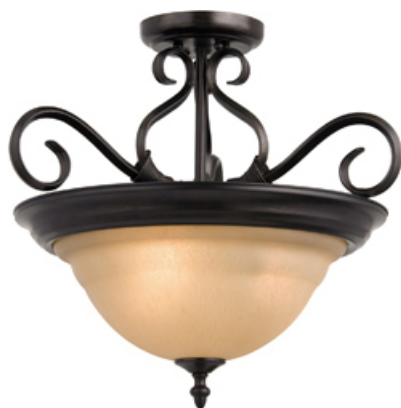
2652WSKB Pacific 3-Light Semi-Flush Mount