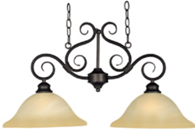
2651WSKB Pacific 2-Light Pendant