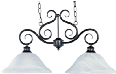
2651MRKB Pacific 2-Light Pendant