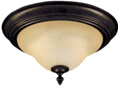
2650WSKB Pacific 2-Light Flush Mount