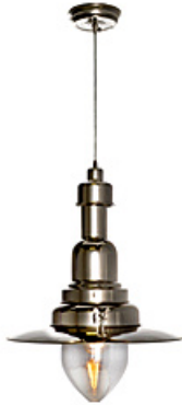
25111MSKPN Hi-Bay 1-Light Pendant