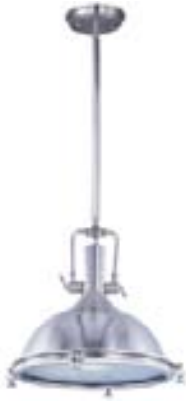
25109FTSN Hi-Bay 1-Light Pendant