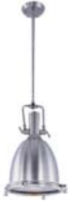
25104FTSN Hi-Bay 1-Light Pendant