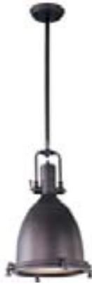
25104FTBZ Hi-Bay 1-Light Pendant