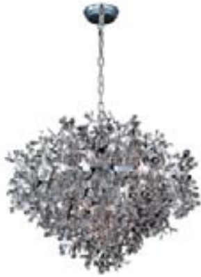
24207BCPC Comet 13-Light Pendant