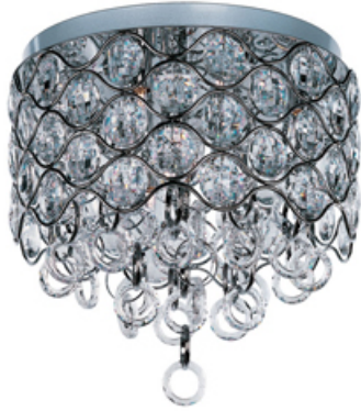
23090BCPC Cirque 7-Light Flush Mount