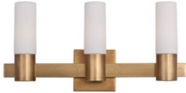
22413SWNAB Contessa 3-Light Bath Vanity