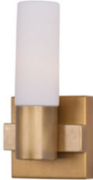
22411SWNAB Contessa 1-Light Wall Sconce