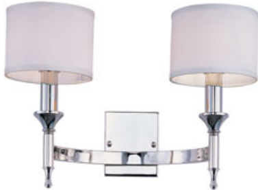
22379WTPN Fairmont 2-Light Wall Sconce