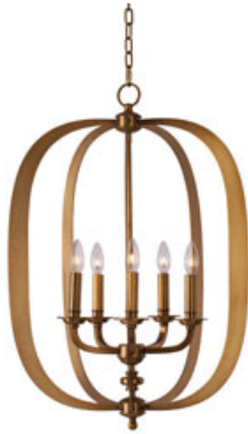
22373NAB Fairmont 5-Light Pendant