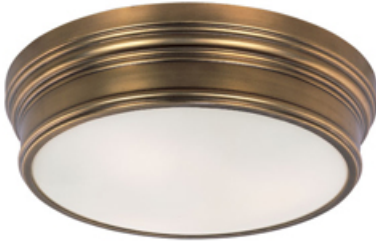
22371SWNAB Fairmont 3-Light Flush Mount