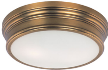
22370SWNAB Fairmont 2-Light Flush Mount