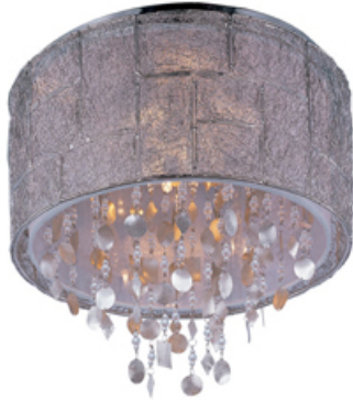
21560TWPN Allure 5-Light Flush Mount