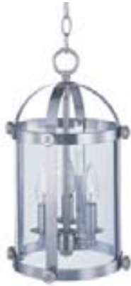
21552CLSN Tara 3-Light Pendant