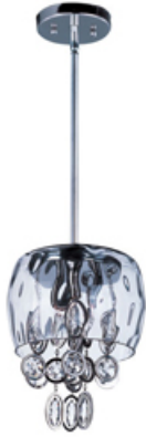
21473WGPN Ripple 3-Light Mini Pendant