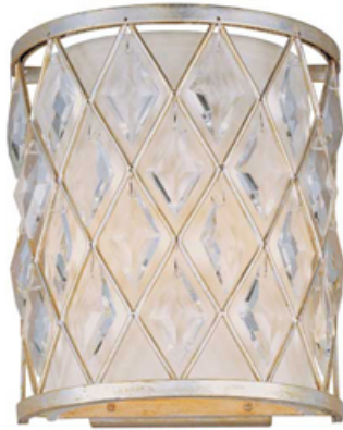
21458OFGS Diamond 2-Light Wall Sconce