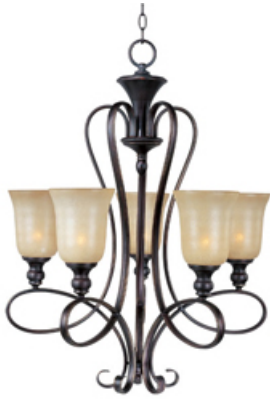
21305WSOI Infinity 5-Light Chandelier