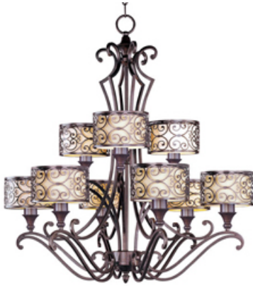
21156WHUB Mondrian 9-Light Chandelier