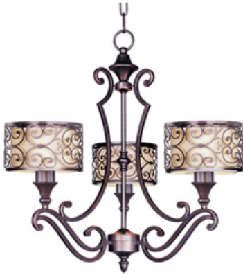
21153WHUB Mondrian 3-Light Chandelier