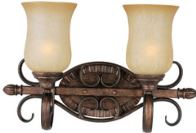
21132MCFL Sausalito 2-Light Bath Vanity