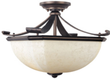
21076FLRB Oak Harbor 2-Light Semi-Flush Mount