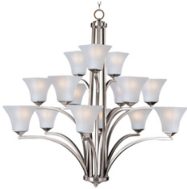
20097FTSN Aurora 15-Light Chandelier