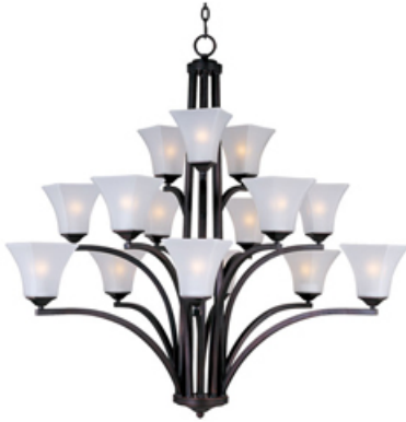
20097FTOI Aurora 15-Light Chandelier