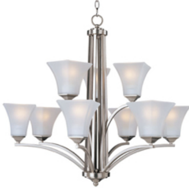
20096FTSN Aurora 9-Light Chandelier