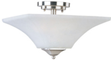
20091FTSN Aurora 2-Light Semi-Flush Mount