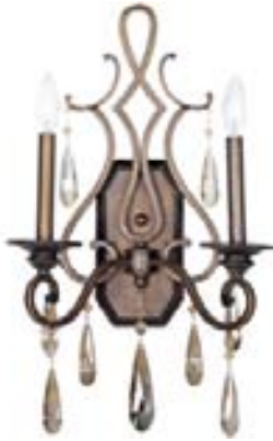
14309HR Chic 2-Light Wall Sconce