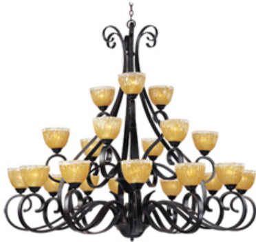
13417AIOI Barcelona 21-Light Chandelier