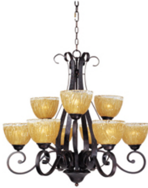
13416AIOI Barcelona 9-Light Chandelier