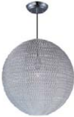
12195PC Twisp 1-Light Pendant