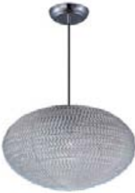
12191PC Twisp 1-Light Pendant