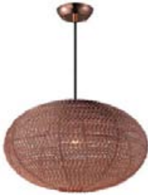
12191CP Twisp 1-Light Pendant