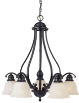
11815ICBK Linda 5-Light Chandelier