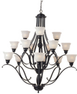
11809ICBK Linda 15-Light Chandelier