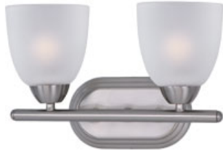
11312FTSN Axis 2-Light Bath Vanity