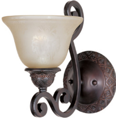
11246SAOI Symphony 1-Light Wall Sconce