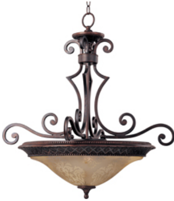
11242SAOI Symphony 3-Light Invert Bowl Pendant