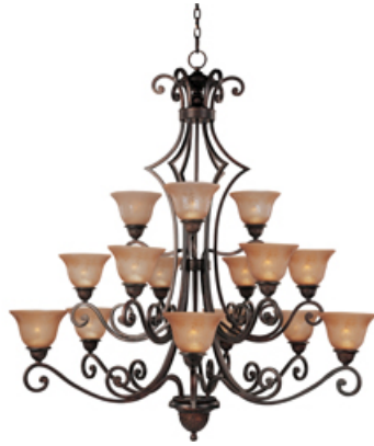
11239SAOI Symphony 15-Light Chandelier