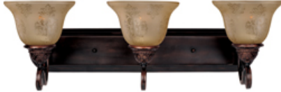
11232SAOI Symphony 3-Light Bath Vanity