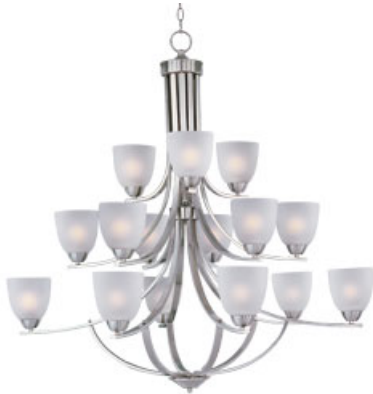
11228FTSN Axis 15-Light Chandelier