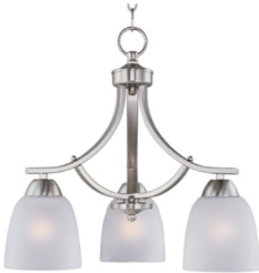
11223FTSN Axis 3-Light Chandelier