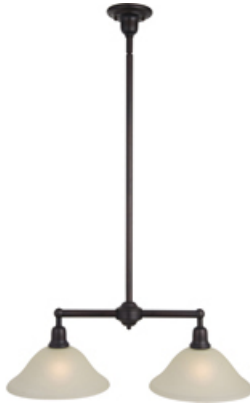
11092SVOI Bel Air 2-Light Pendant