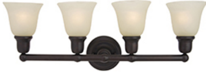
11089SVOI Bel Air 4-Light Bath Vanity