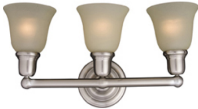
11088SVSN Bel Air 3-Light Bath Vanity