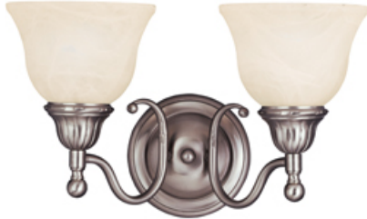
11057SVSN Soho 2-Light Bath Vanity