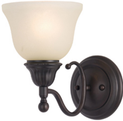
11056SVOI Soho 1-Light Wall Sconce