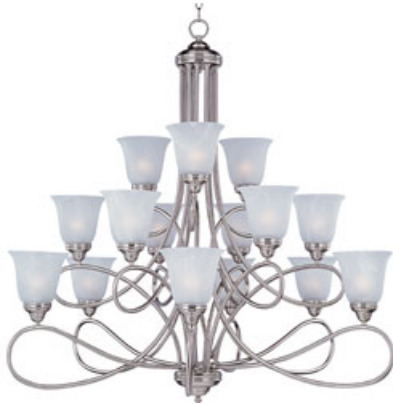
11045MRSN Nova 15-Light Chandelier